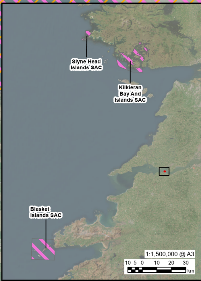
FIGURE NUMBER 9.1

ISSUE PURPOSE FINAL PROJECT NUMBER 60707258 FIGURE TITLE European sites within the ZoI of the Proposed Development